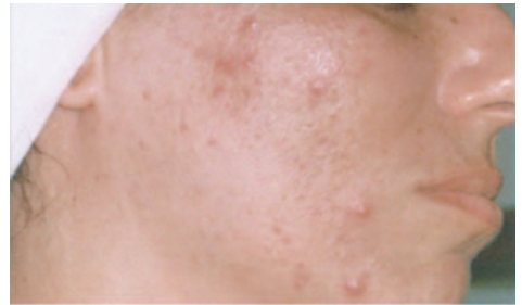
Before CACI treatment

The Electro Cellulite Massager treatment gives instant lifting and contouring on the buttocks and toning of the thighs. This treatment will improve the appearance of cellulite and break down fatty deposits. It will also stimulate circulation and lymphatic drainage, which will help to flush toxins away giving a smoother and tighter, dimple free appearance. Great as a pre-holiday body blitz.