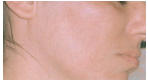
After CACI treatment

Book and pay for a course of any 10 Caci treatments and receive a 10% discount.